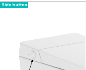
Side button Electronically controlled flushing method A: Press the side button to flush.