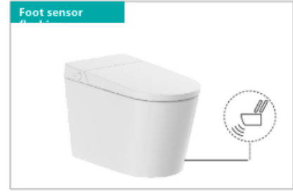
Foot sensor Foot sensing flushing method D: Foot sensor for half flushing.