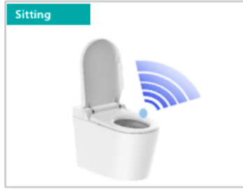
Sitting Electronically controlled flushing method C: After leaving the seat, the toilet (full) flushing function can be automatically activated.