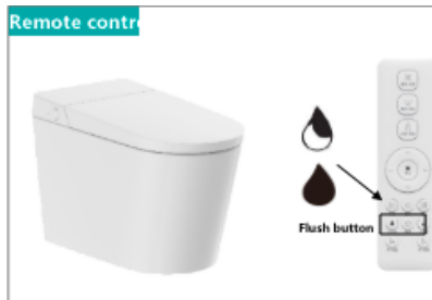
Remote control Electronically controlled flushing method B: Use the remote control to flush.